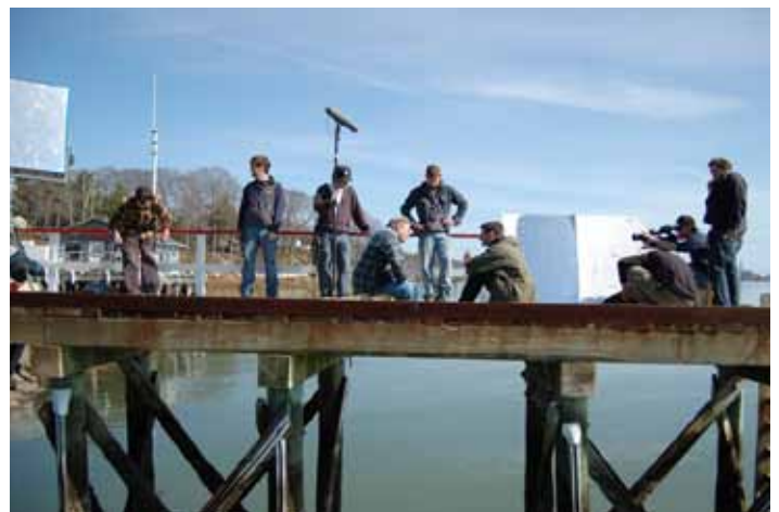
Cast and crew prepare for a scene during production of “A Marine’s Guide to Fishing”. The film was shot along the coast of southern Maine.